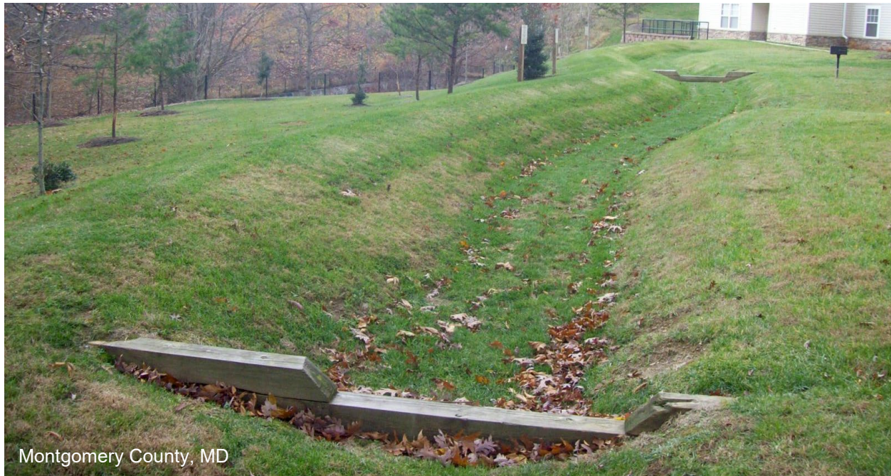
Montgomery County, MD