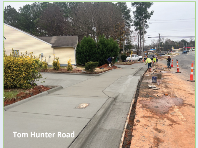
Tom Hunter Road