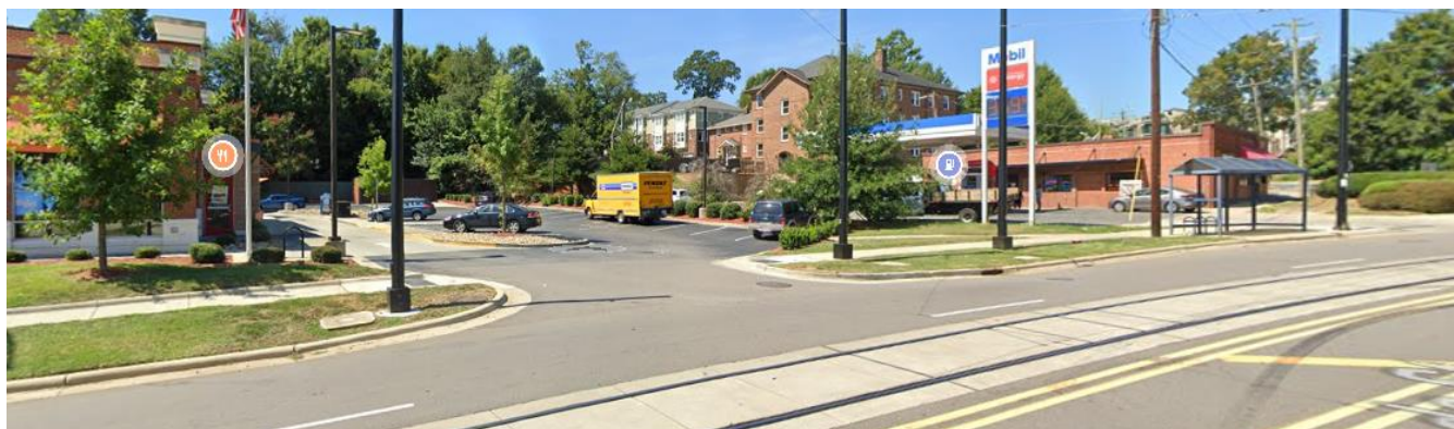
View from West Trade Street of the commercial and multi-family residential uses to the south of the site.