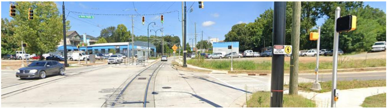
View from West Trade Street of the transit stop and automotive uses to the west of the site.