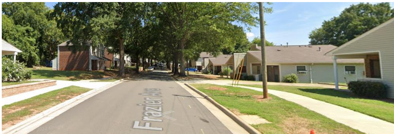
View of the residential duplexes on Frazier Avenue to the north of the site.