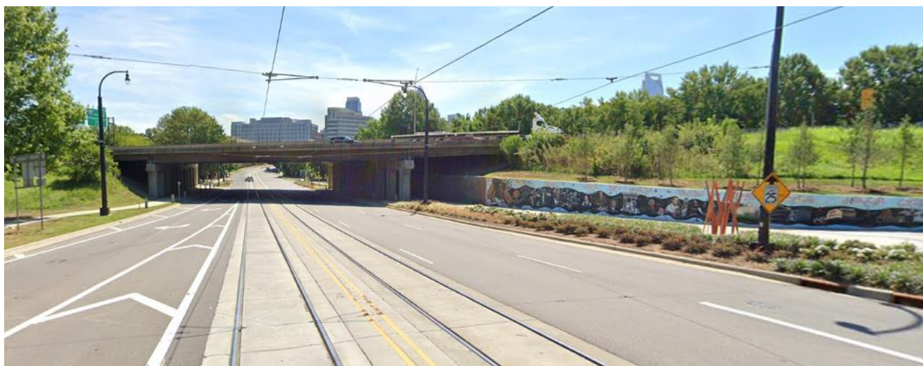
View of the highway interchange on West Trade Street east of the site.