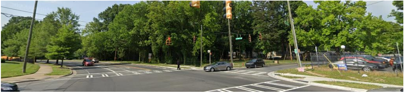
Street view of the site looking northeast from the signalized intersection of Ashley Road and Greenland Avenue.