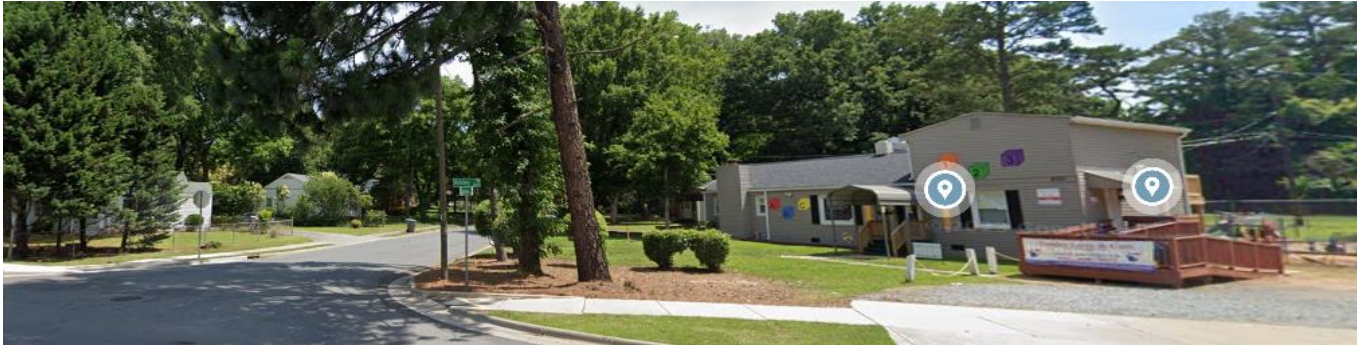
The properties to the north of the site along Ashley Road and Lumina Avenue are developed with single family residential and institutional uses.