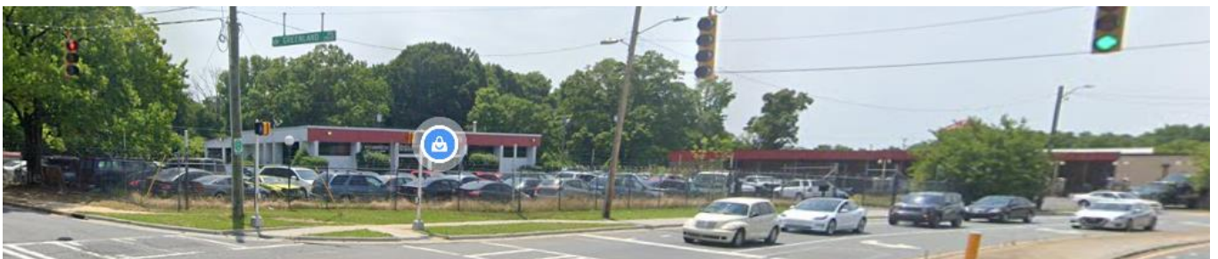
The properties to the south of the site along Ashley Road are developed with commercial uses.