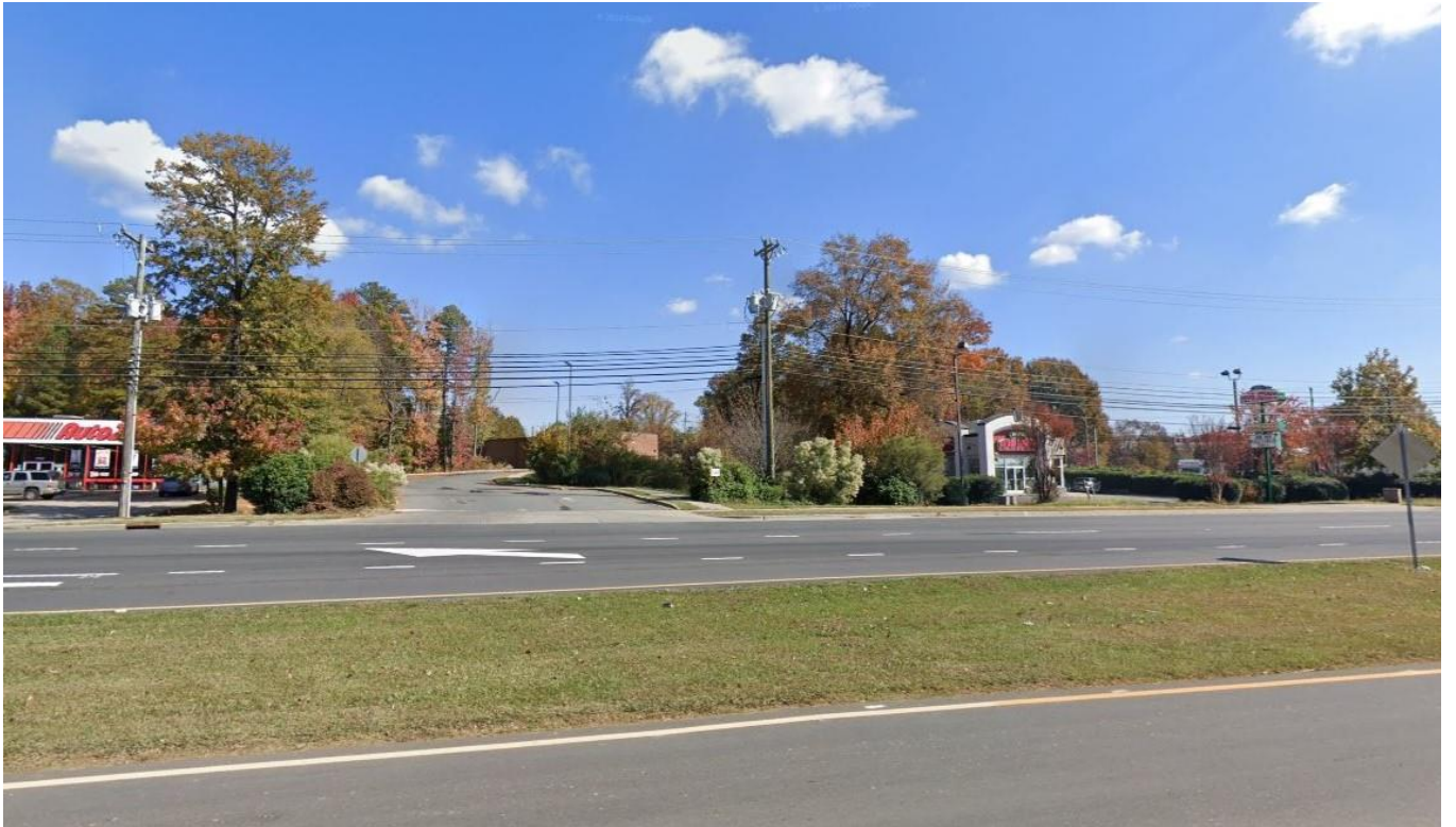
View commercial development located near the intersection of Statesville Road and Old Statesville Road south of the site.