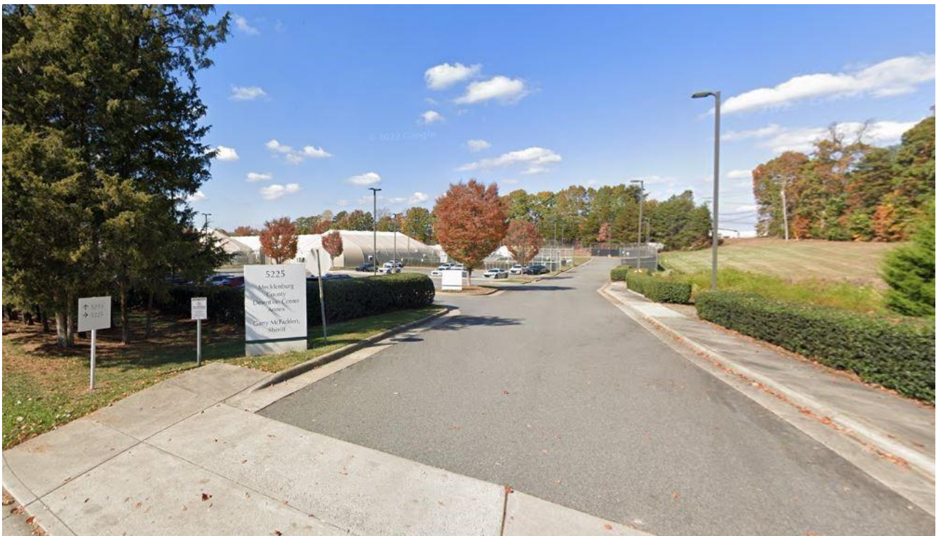
View of a Mecklenburg County correctional facility located on Statesville Road west of the site.