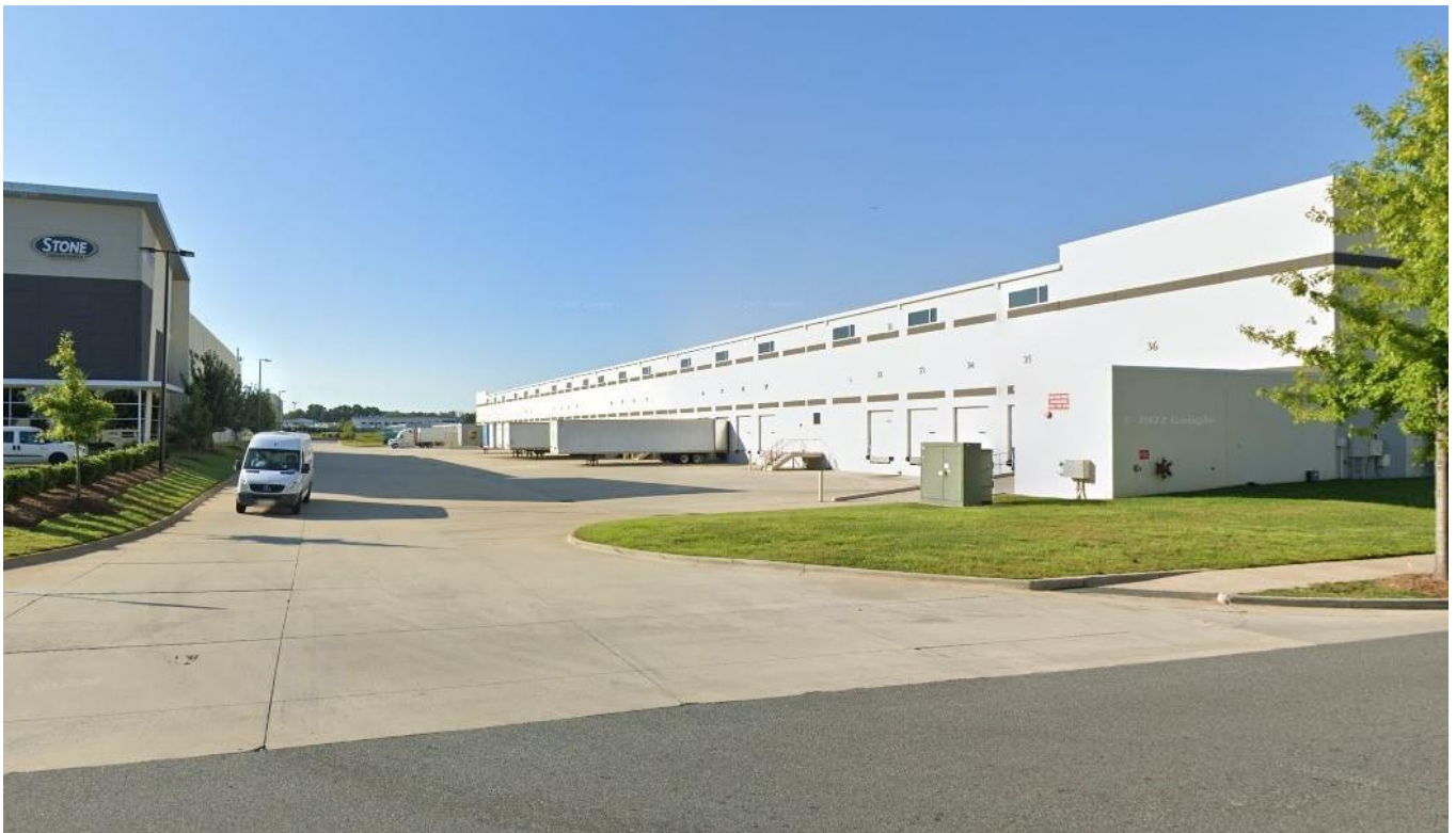
View of a newer warehousing/industrial development north of the site off Statesville Road.