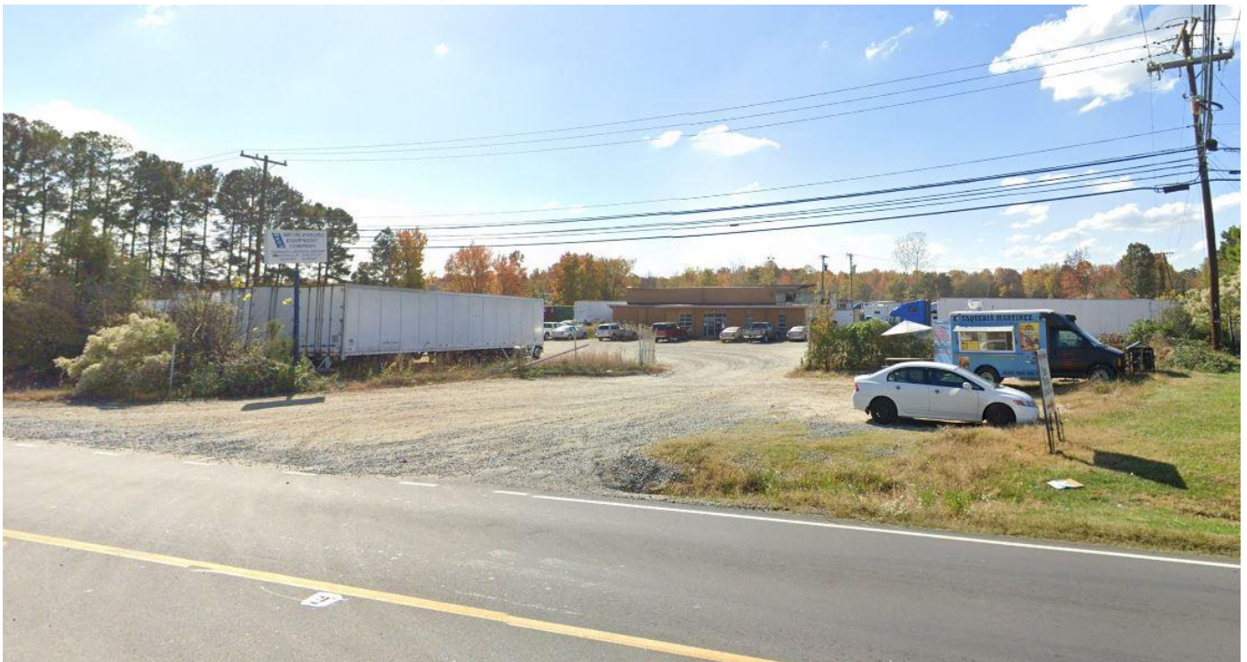
View of an older warehousing/industrial development on the west side of Statesville Road typical of the development pattern in the area.