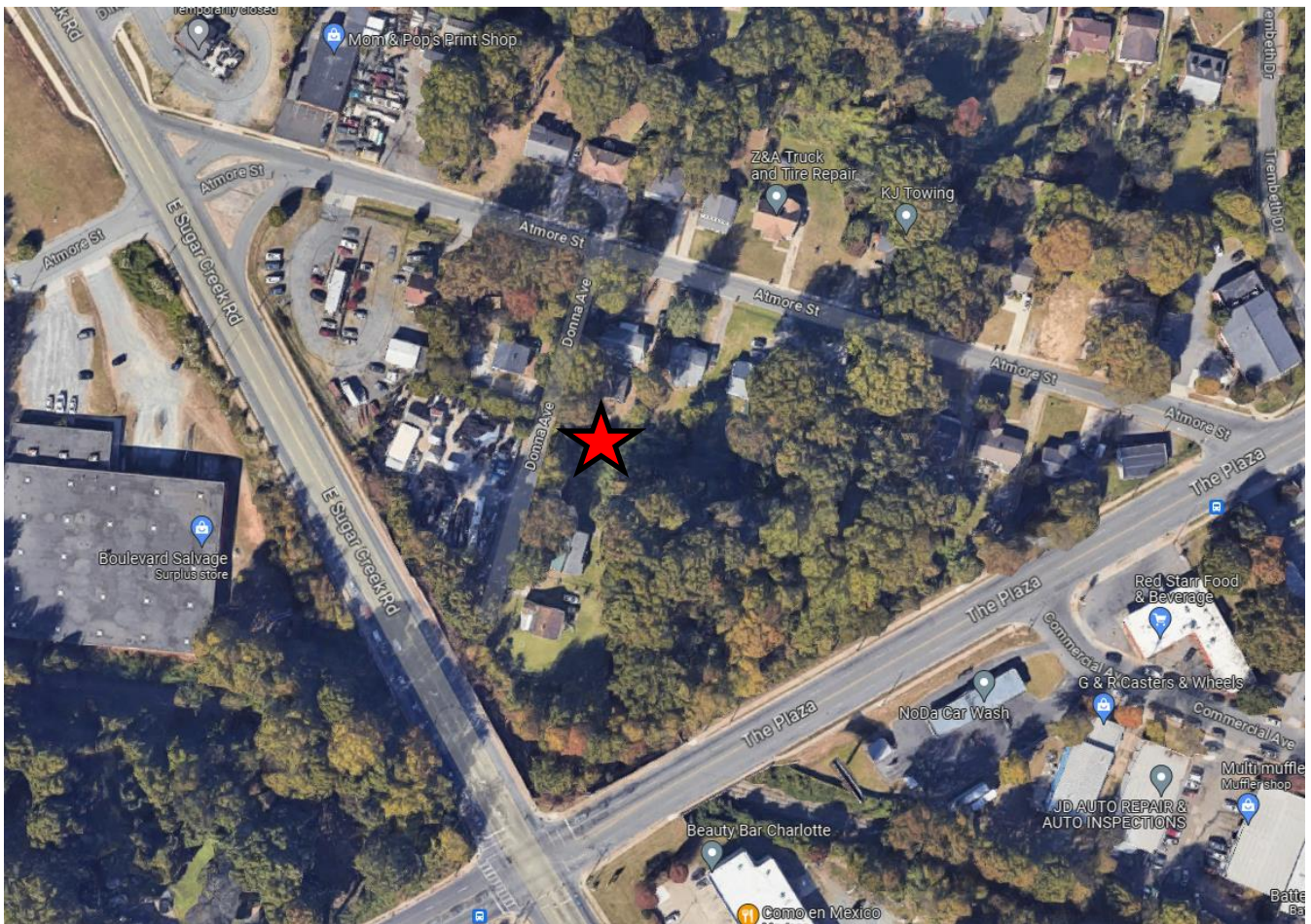
Provide birds eye caption that includes general summary of surrounding land use in area. (surrounding land use).