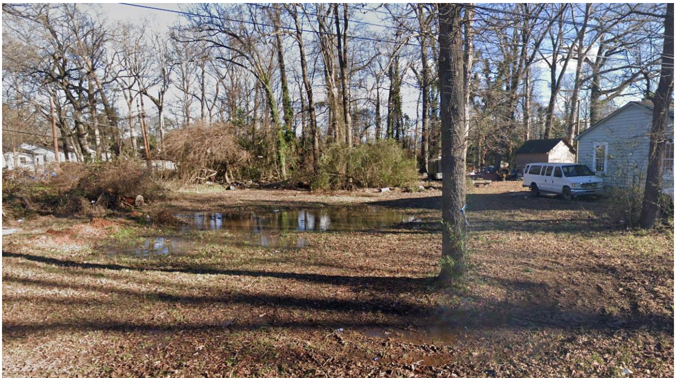
The site is currently vacant.