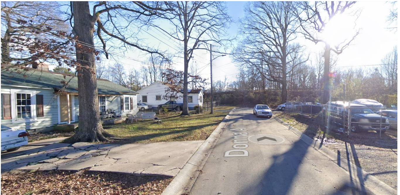
South of the site is a dead-end street with single family homes on the east side of the road and car park to the west.