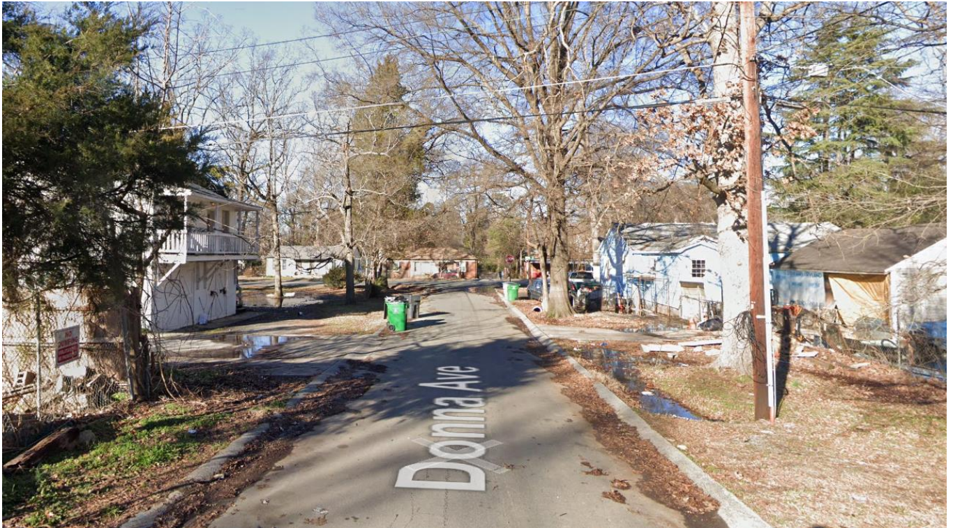
North of the site are two single family homes on the east and west of the street.