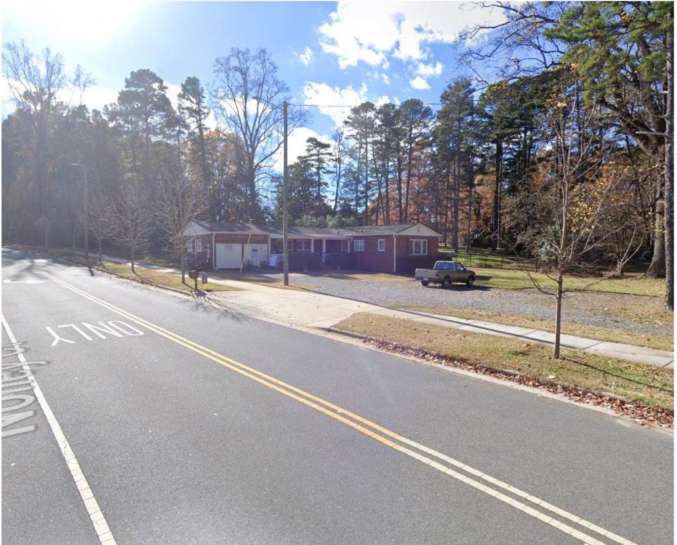
The site is currently occupied with a single-family home, located on the southwest intersection of Sardis Road North and Nolley Court.