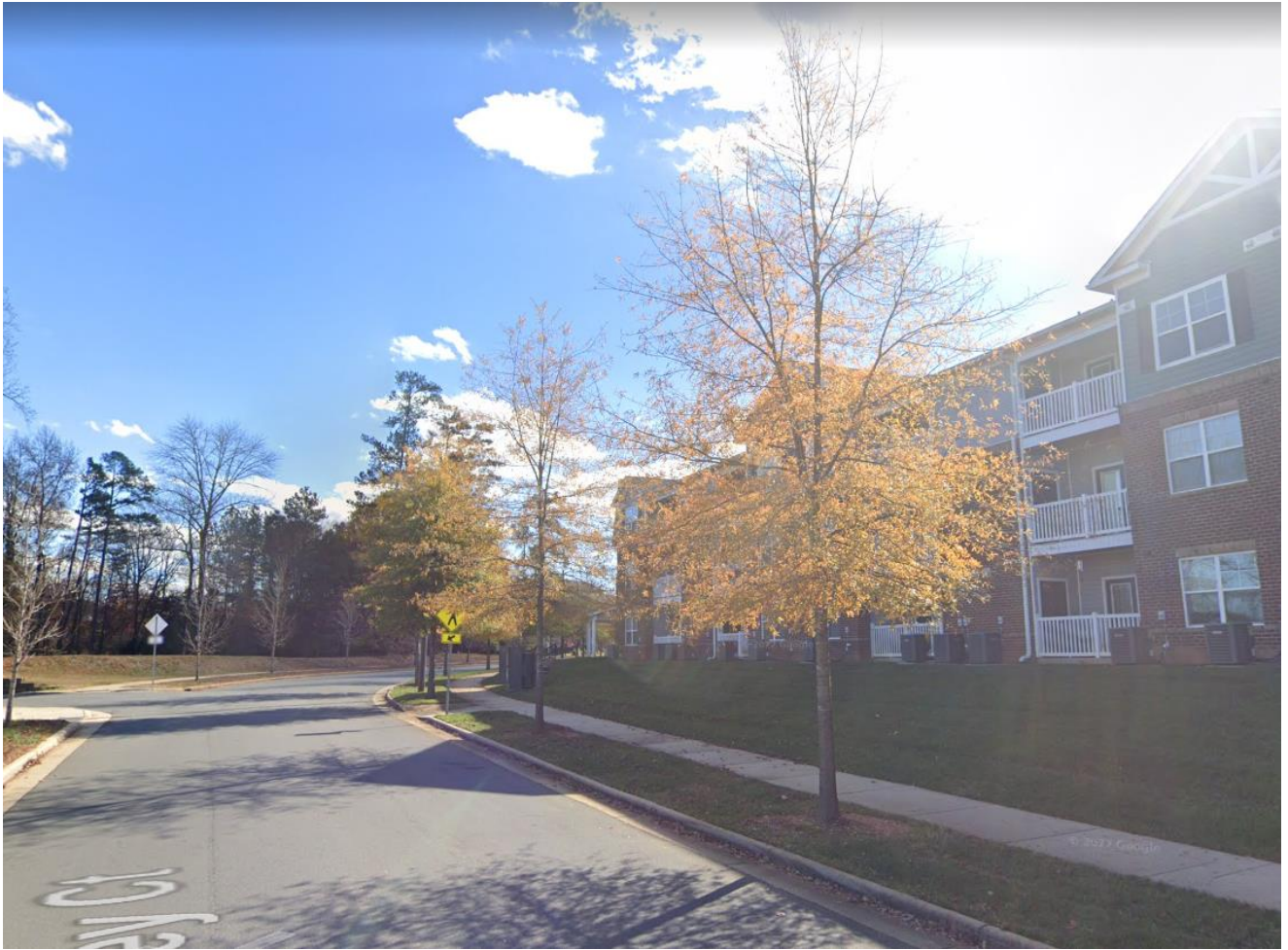
South of the site are multi-family uses.