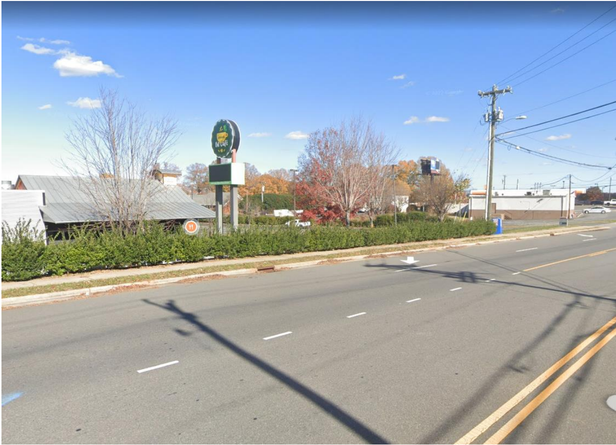
Northeast of the site are restaurants and commercial uses.