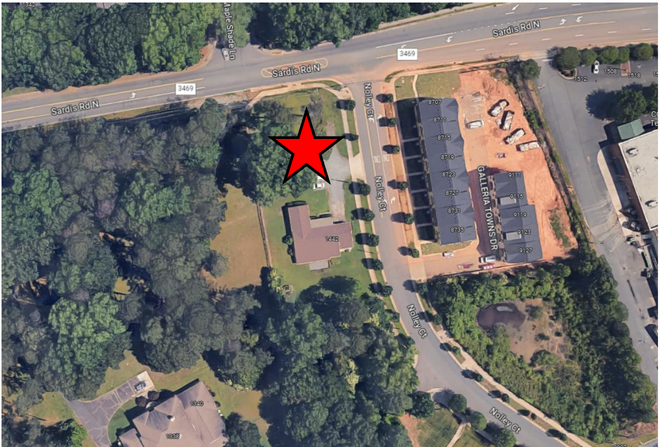
The site is located just across Nolley CT, with townhomes adjacent to the site and a large shopping center to the east.