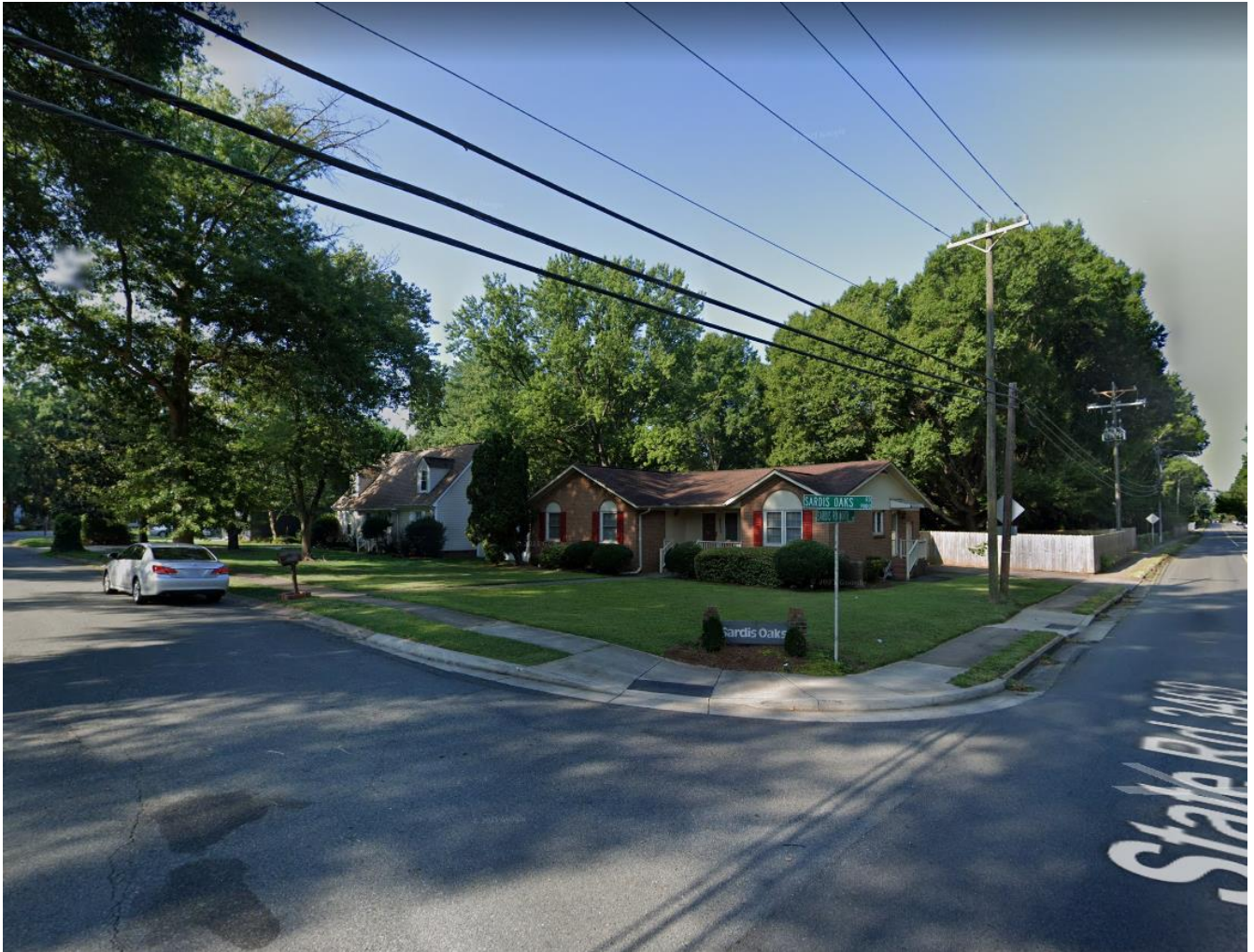
West of the site are single family homes.