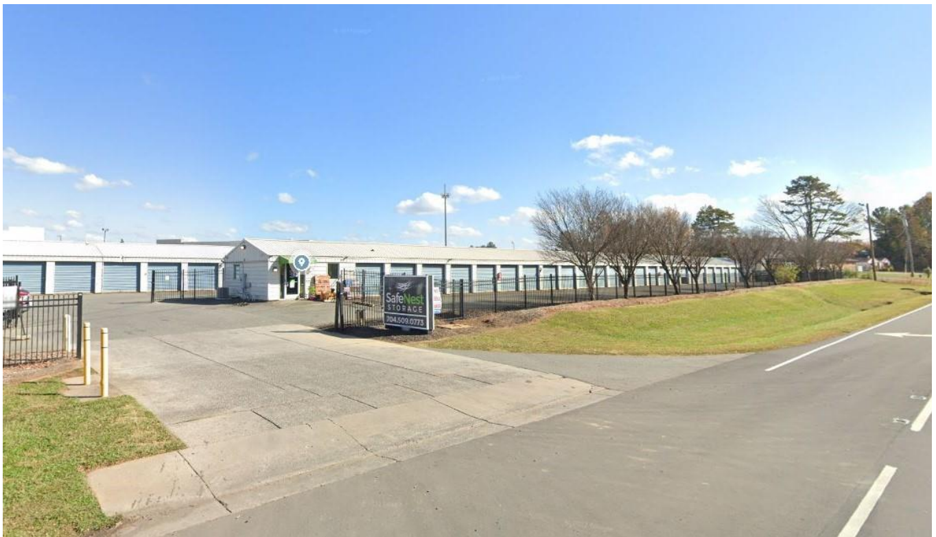
View of the site looking east from the Statesville Road. The property is currently developed with a self-storage facility.