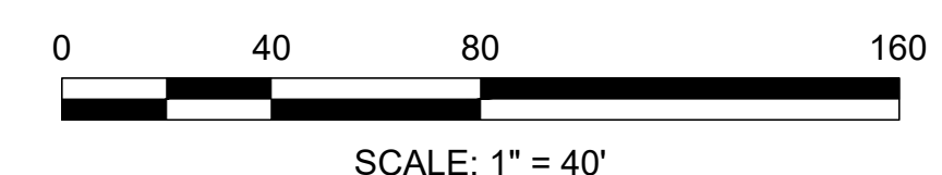
SCALE: 1" = 40'