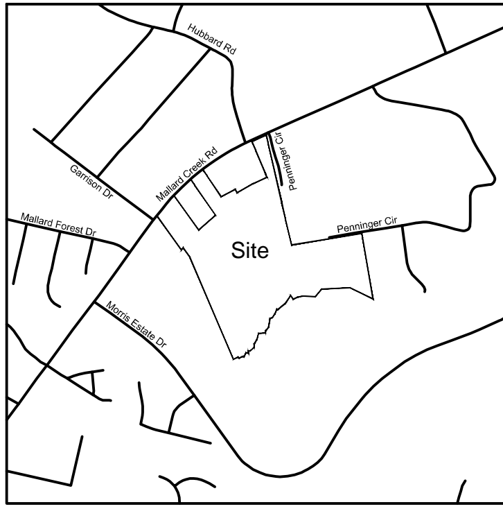
Vicinity Map n.t.s