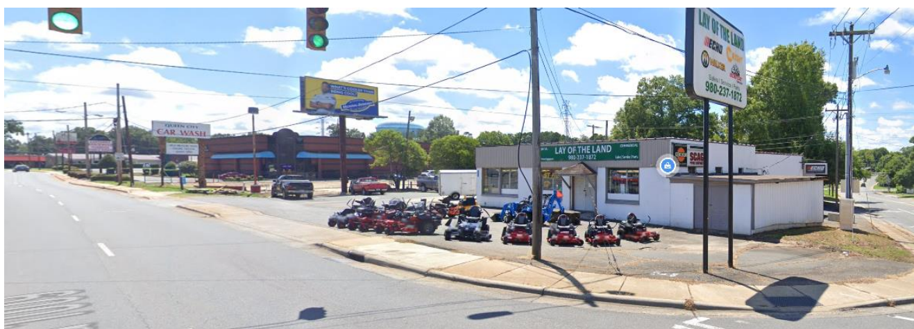
South of the site are railroad tracks, retail uses, autobody shop, and a car wash.