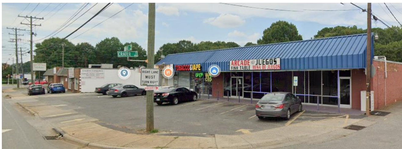
West of the site are autobody shops, corner stores, a animal hospital, a brewery, urgent care, and a neighborhood of single-family homes slightly adjacent to Monroe Rd.