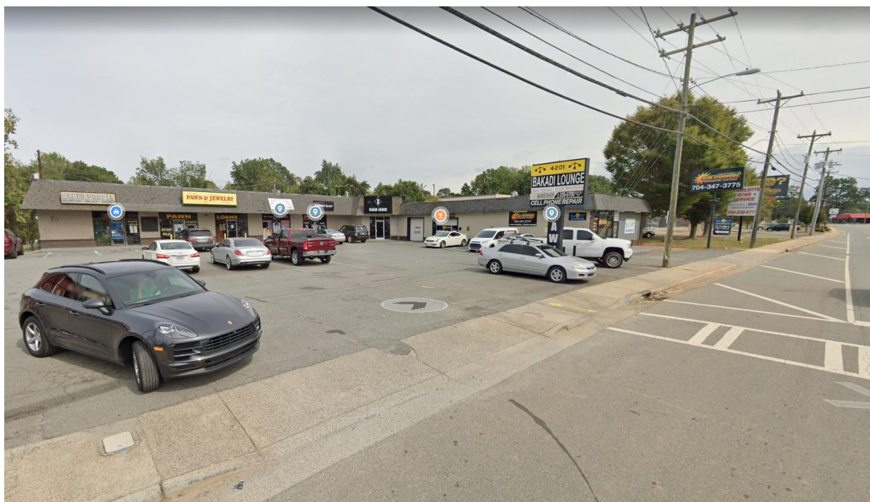
East of the site are several commercial businesses, and non-residential uses.