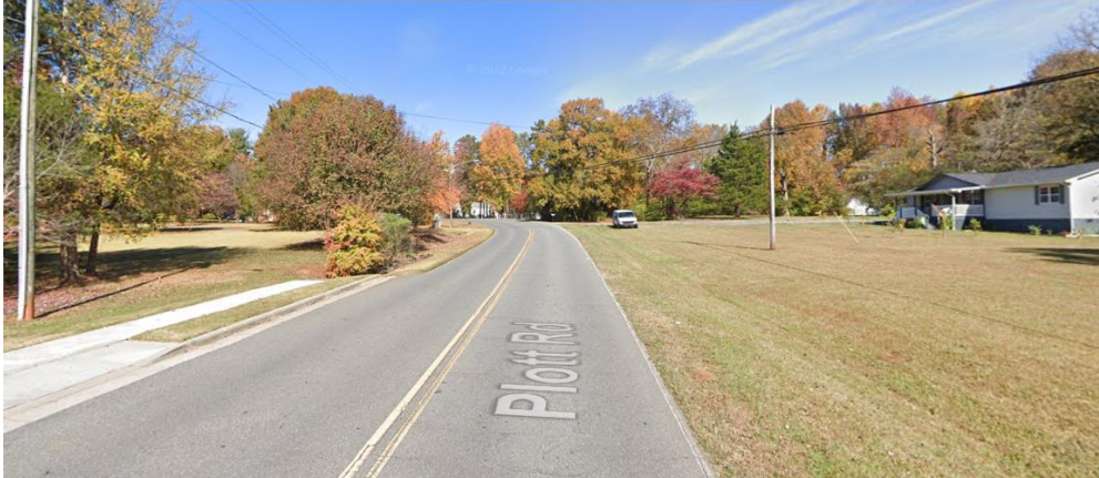
North and south along Plott Road (above and below pics) are single family homes and parks/greenways.