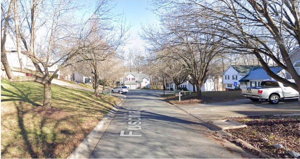
East are single family homes.