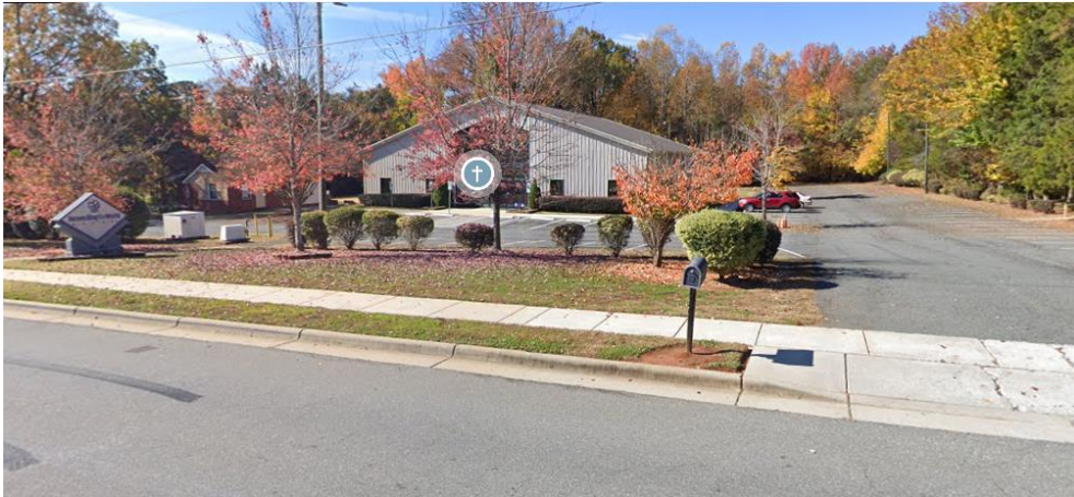
West is a religious institution.