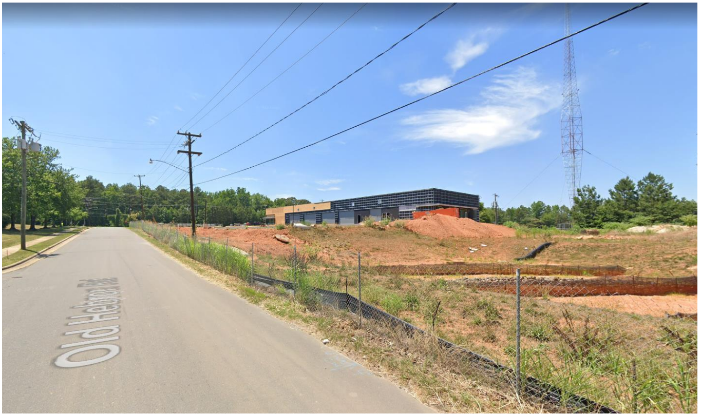
West of the site is television towers and an industrial building.