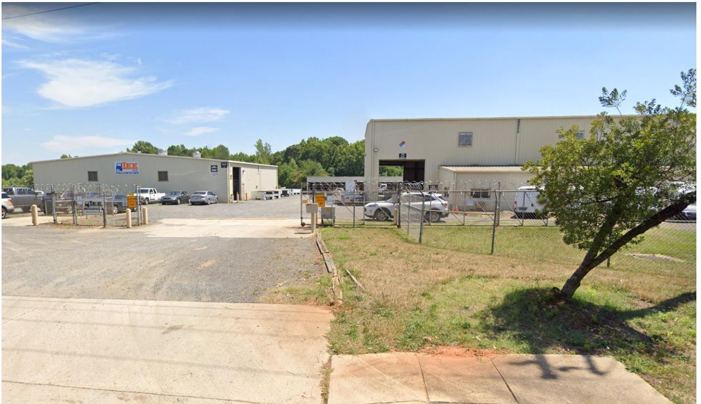
South of the site is a warehouse for truck auto parts and neighboring this business is a vacant lot.