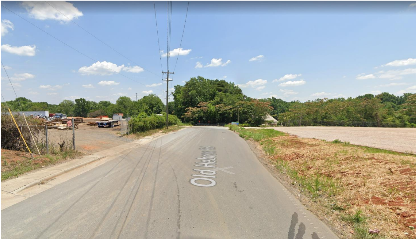
East of the site is a wooded area with a vacant lot neighboring the woods, along with a pallet and recycling center as well as a contracting company in an industrial building.