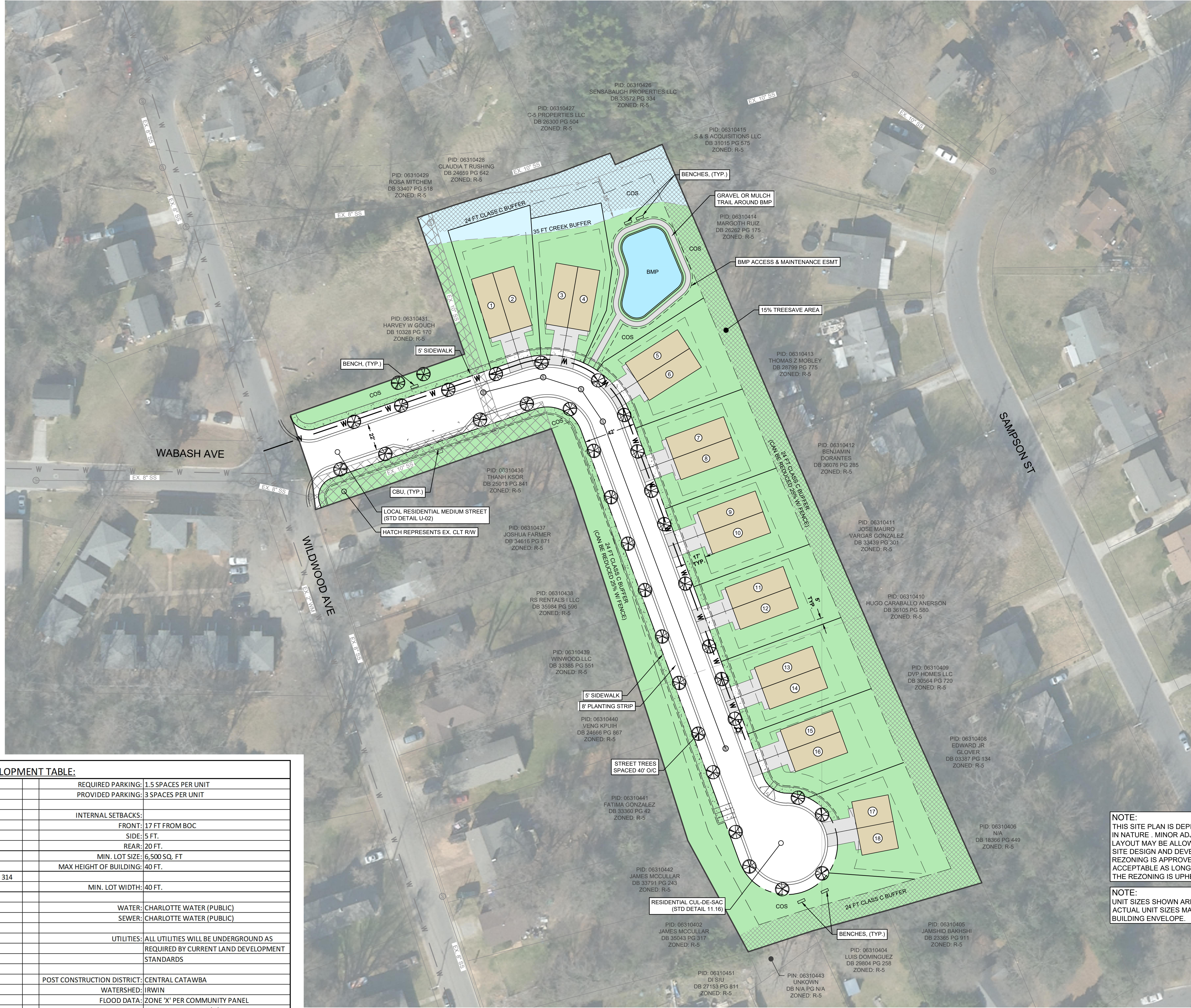
SITE DEVELOPMENT TABLE:

Binding Effect of the Rezoning Documents and Definitions: 1) If this Site Plan Amendment is approved, all conditions applicable to development of the Site imposed under the Technical Data Sheet will, unless amended in the manner provided under the Ordinance, be binding upon and inure to the benefit of the Petitioner and the current and subsequent owners of the Site and their respective successors in interest and assigns. 2) Throughout these Development Standards, the terms, "Petitioner" and "owner" and "owners" shall be deemed to include the heirs, devisees, personal representatives, successors in interest or assigns.