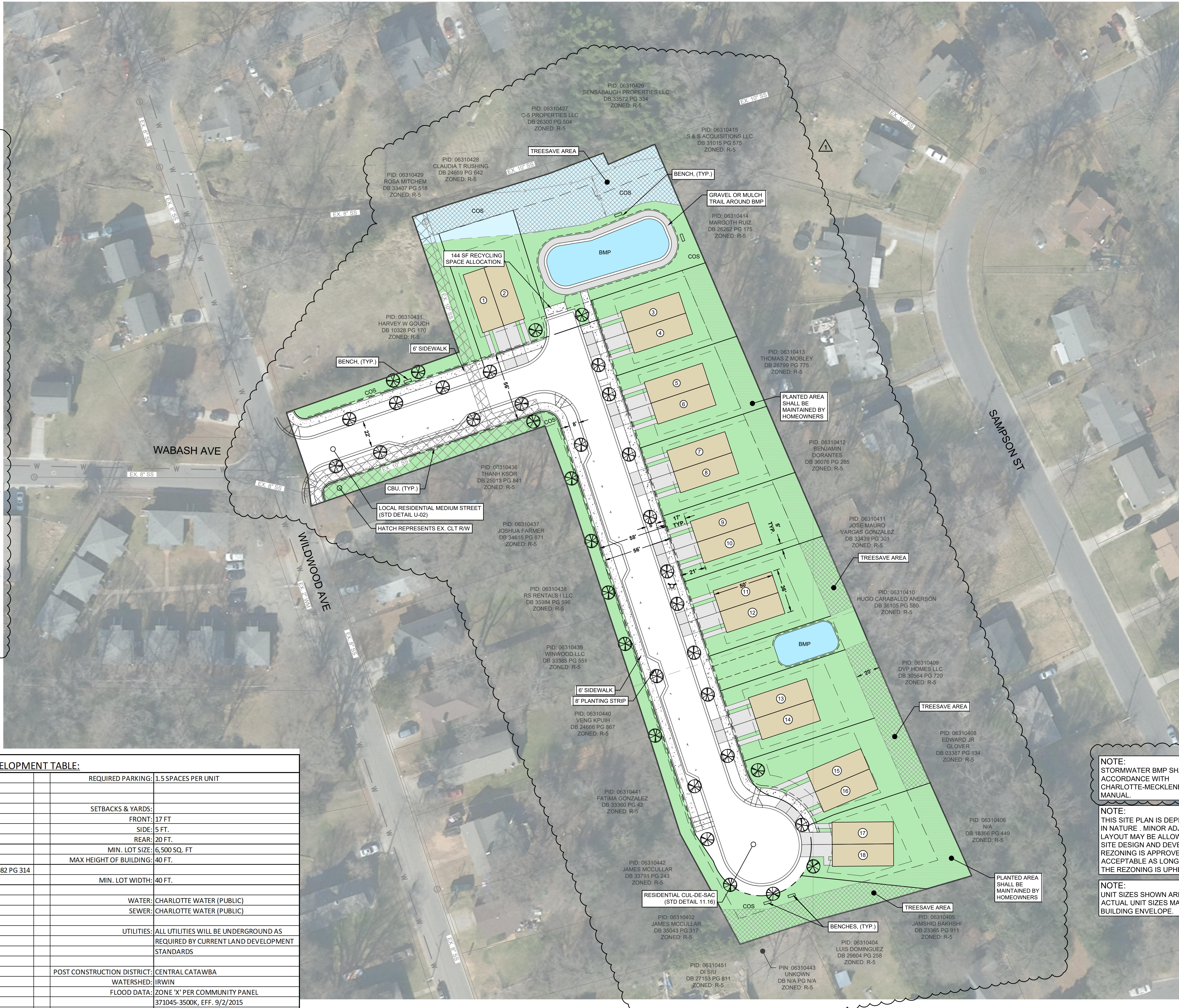
SITE DEVELOPMENT TABLE:

Binding Effect of the Rezoning Documents and Definitions: 1) If this Site Plan Amendment is approved, all conditions applicable to development of the Site imposed under the Technical Data Sheet will, unless amended in the manner provided under the Ordinance, be binding upon and inure to the benefit of the Petitioner and the current and subsequent owners of the Site and their respective successors in interest and assigns. 2) Throughout these Development Standards, the terms, "Petitioner" and "owner" and "owners" shall be deemed to include the heirs, devisees, personal representatives, successors in interest or assigns.