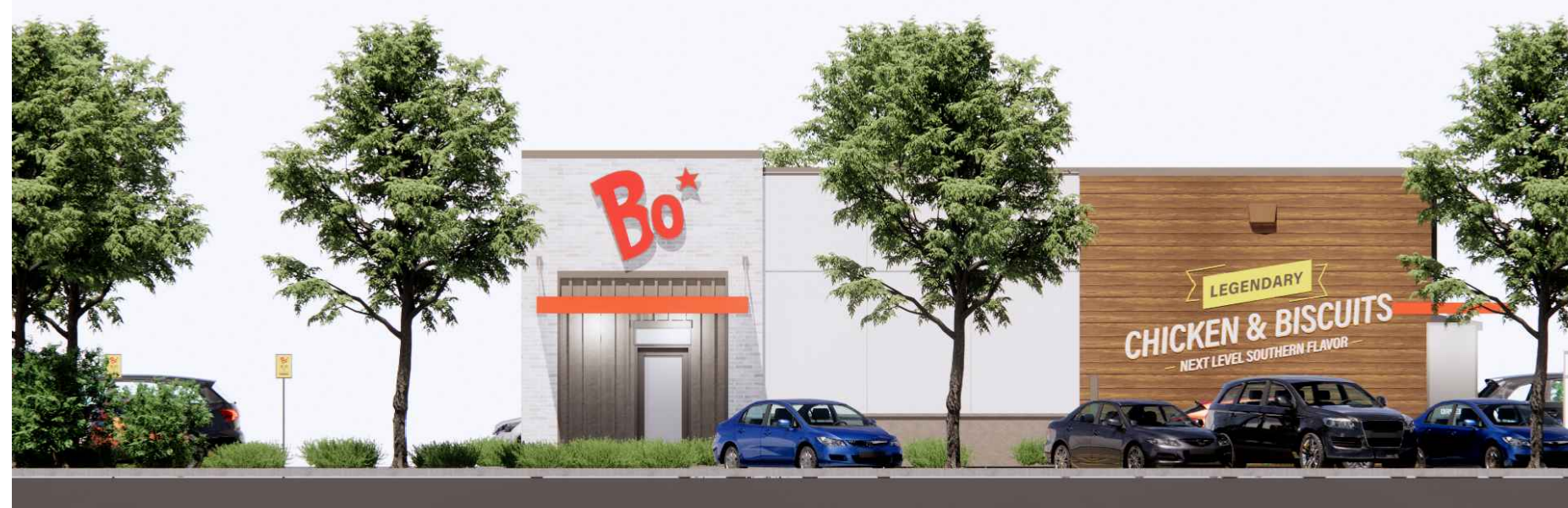
PROPOSED CONCEPTUAL ELEVATIONS