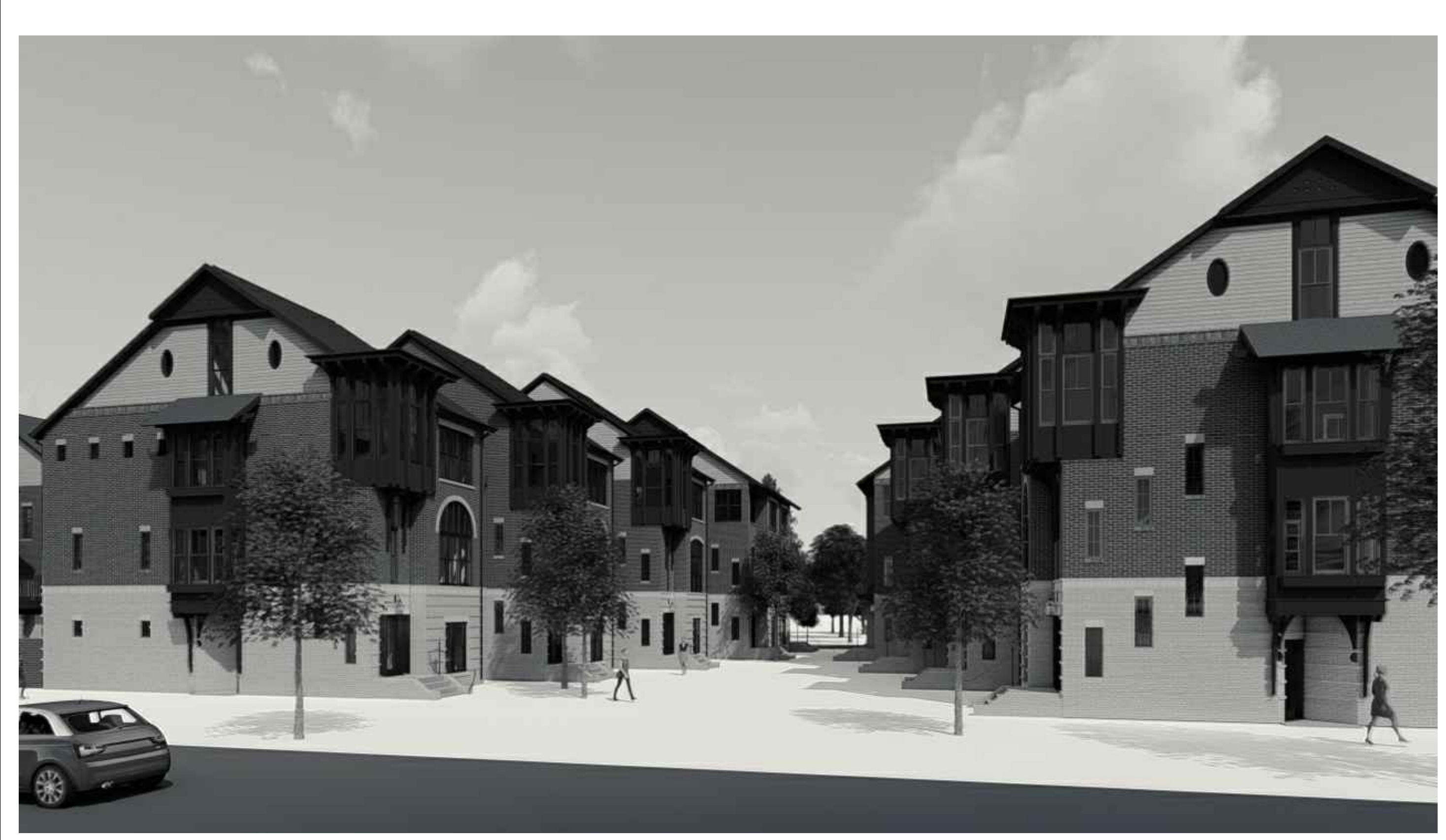
MARVIN ROAD SIDE ELEVATION