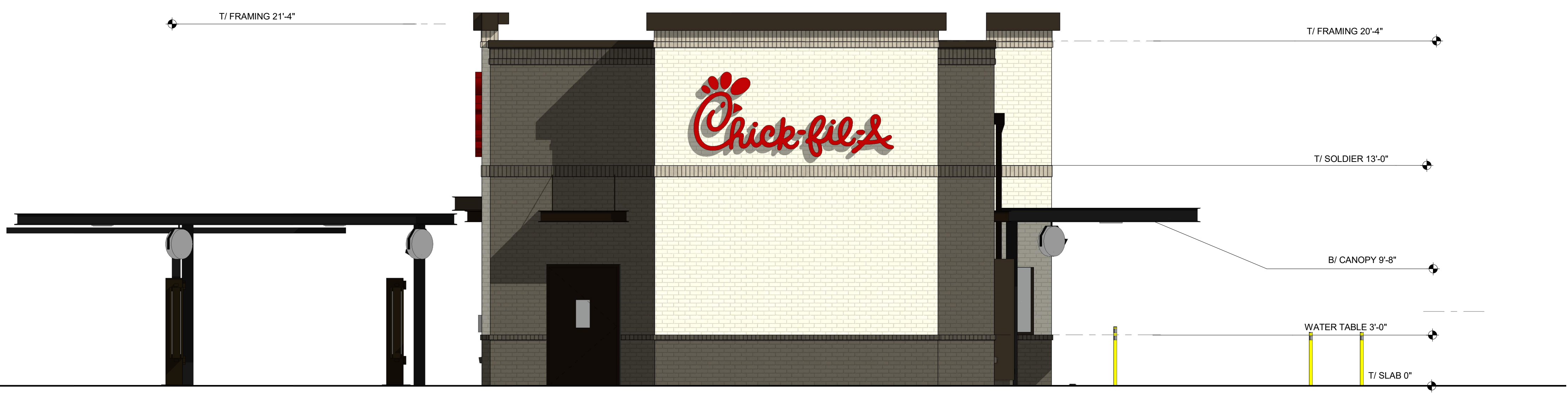
4 EXTERIOR ELEVATION 1/4" = 1'-0"