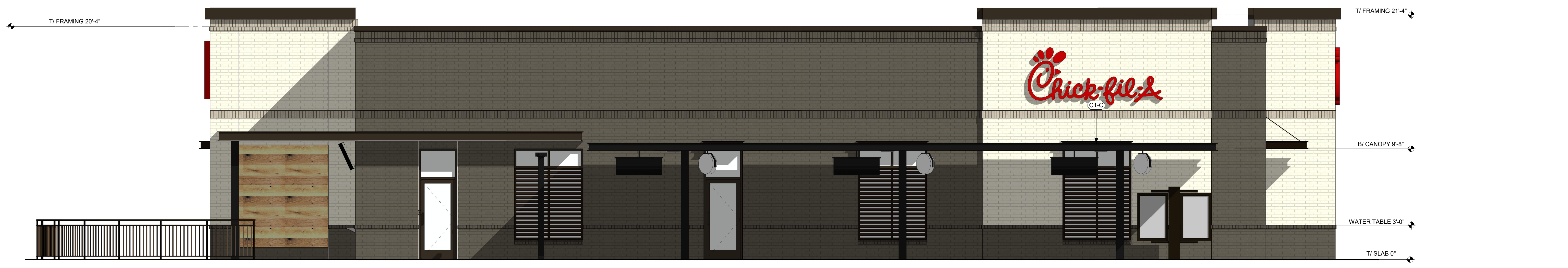
3 EXTERIOR ELEVATION 1/4" = 1'-0"