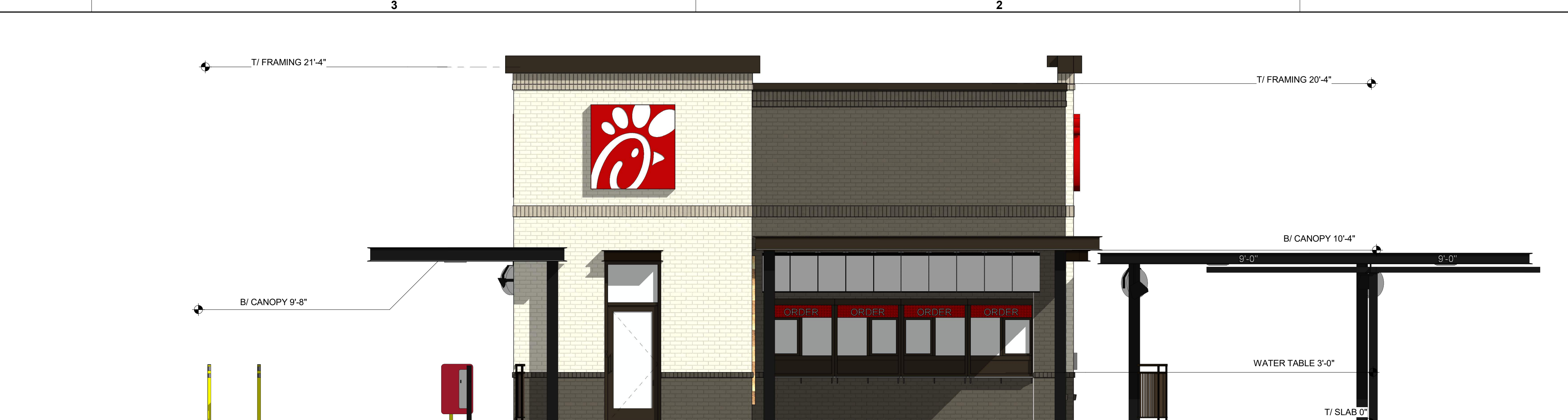
1 EXTERIOR ELEVATION 1/4" = 1'-0"