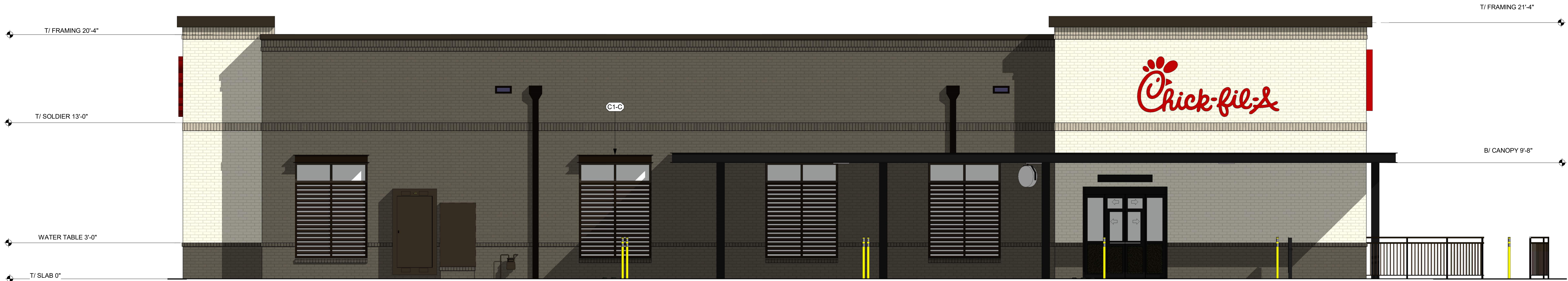
2 EXTERIOR ELEVATION 1/4" = 1'-0"