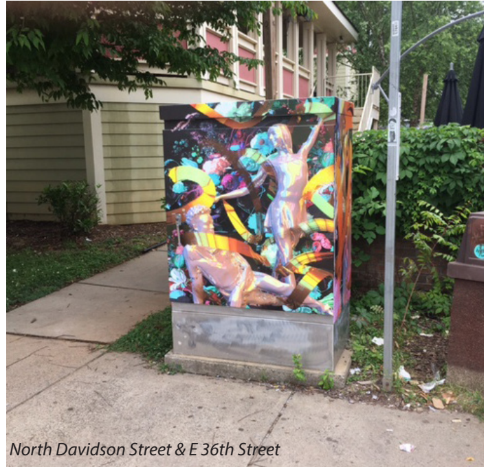
North Davidson Street & E 36th Street