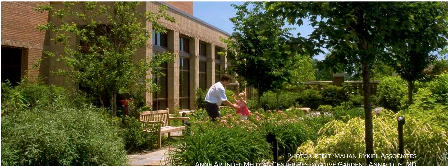
ANNE ARUNDEL MEDICAL CENTER RESTORATIVE GARDEN - ANNAPOLIS, MD

Engage community members in a creative placemaking process to build a foundation to establish trust and healing to catalyze transformation through an approach grounded in neuroscience and trauma-informed care. Work with artists and social workers to lead a trauma-informed design process to co-create public art acknowledging community trauma that residents may have faced. Use evidence-based environmental psychology to design a healing garden to promote connections to nature, reduce stress, and enhance social cohesion. This garden could take the shape of a restorative pocket park or small natural area to be installed as part of a future public-private partnership redevelopment.