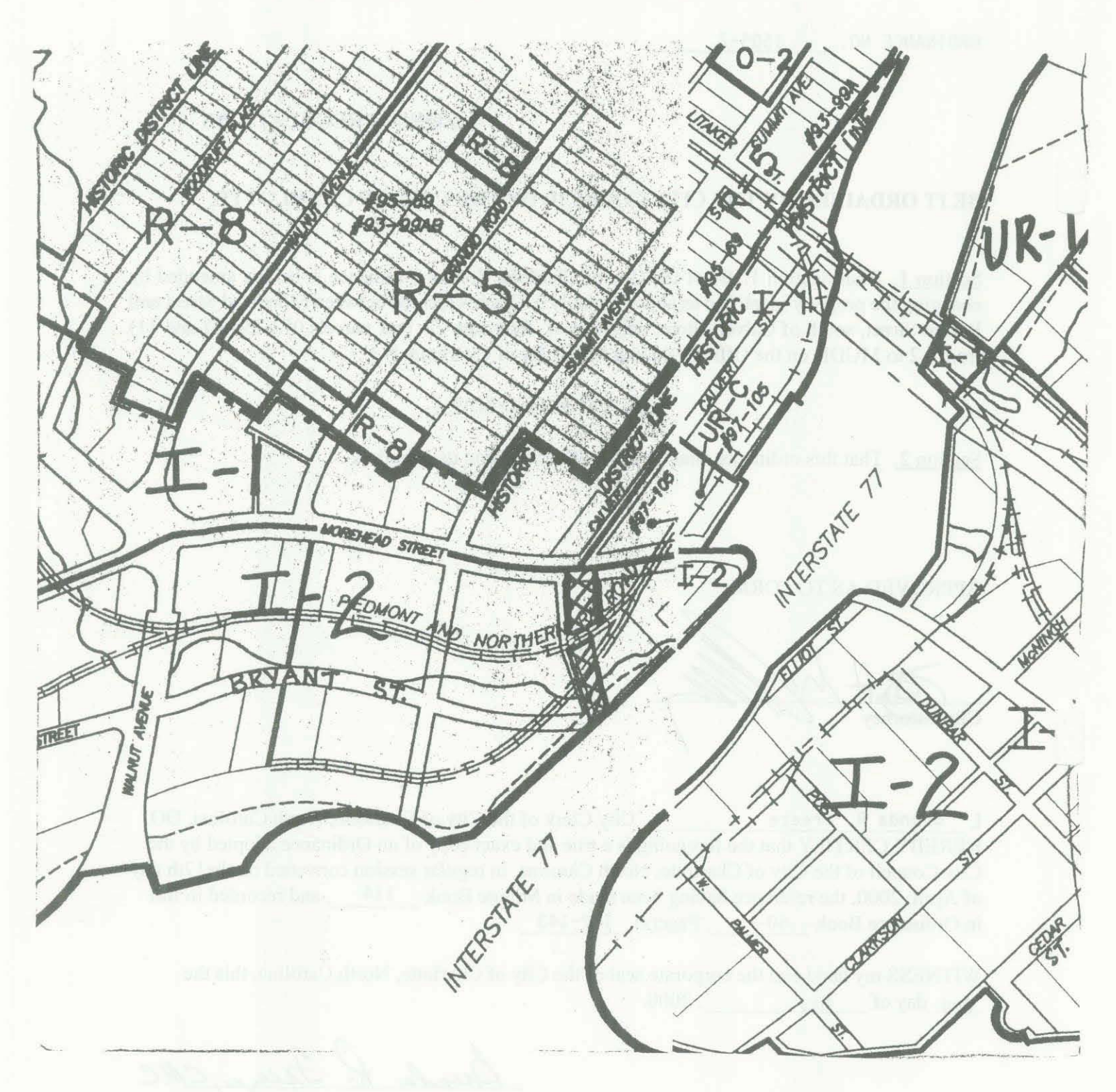
Zoning Map #(s): 103,

south of Calvert Street and west of Interstate 77.