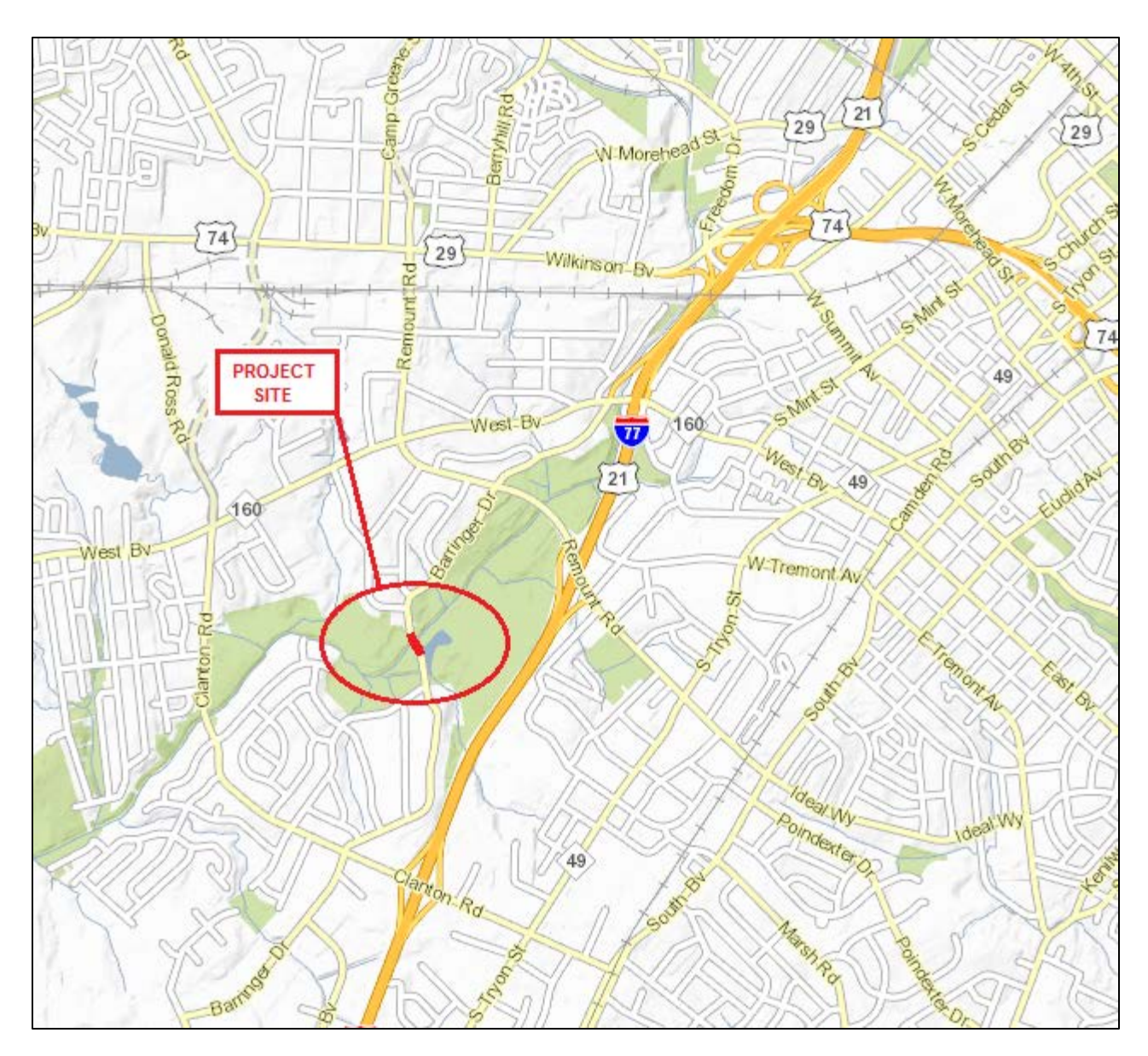
Location Map: Barringer Drive Bridge Replacement Project (Council District 3)