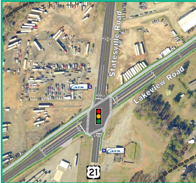
Statesville Road (US 21) Add turn lanes