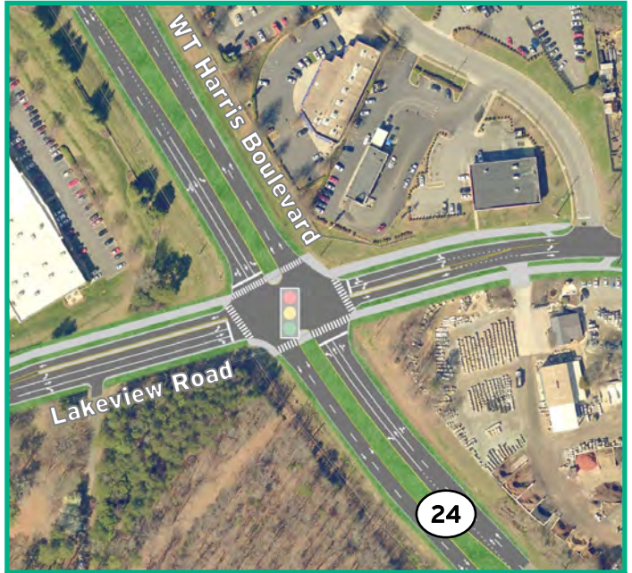
W.T. Harris Boulevard (NC 24) Lengthen turn lanes