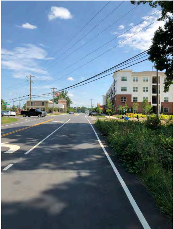
Looking south toward Ridge Rd