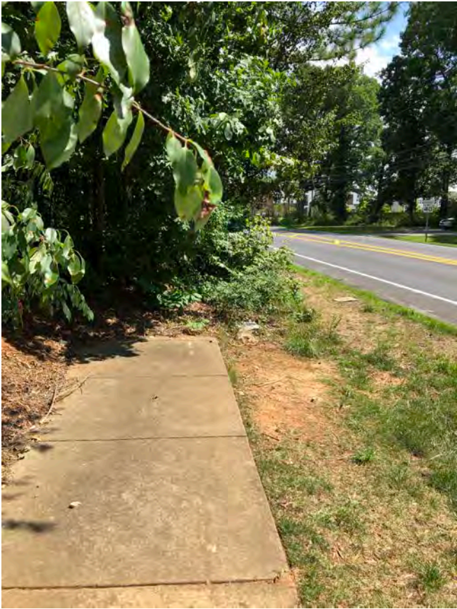
Looking south toward Chick-fil-A