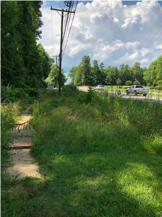
Looking north toward Benfield Rd