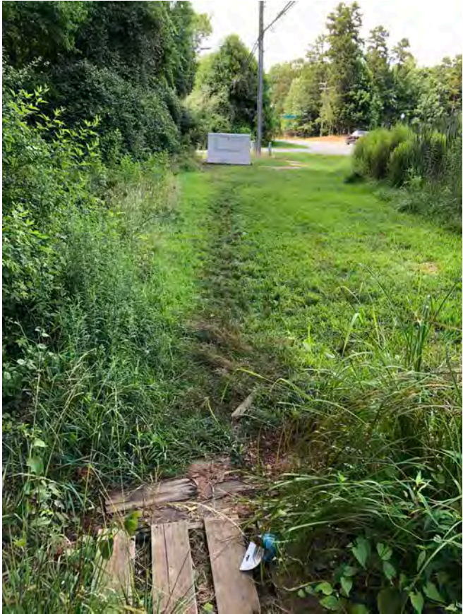
Looking north toward Benfield Rd