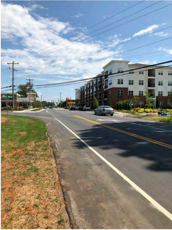
Looking south toward Chick-fil-A