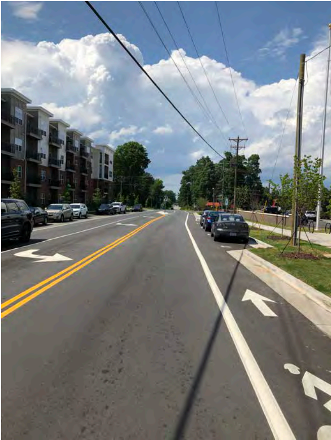
Looking north toward Benfield Rd