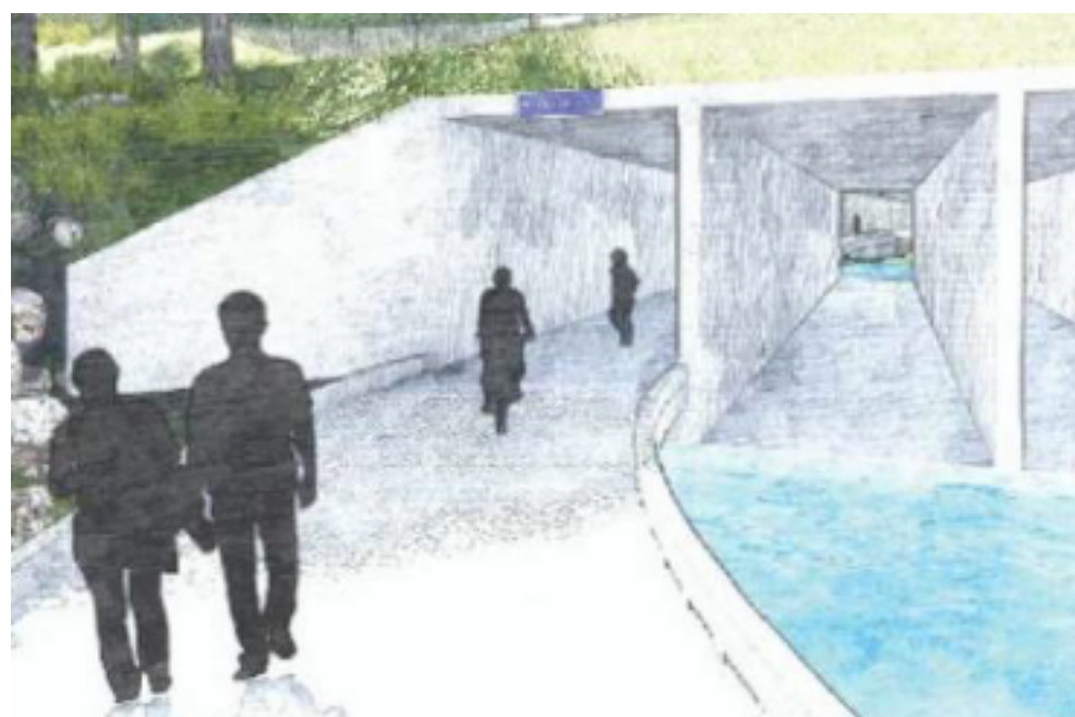
Example image of a greenway passageway beneath the road